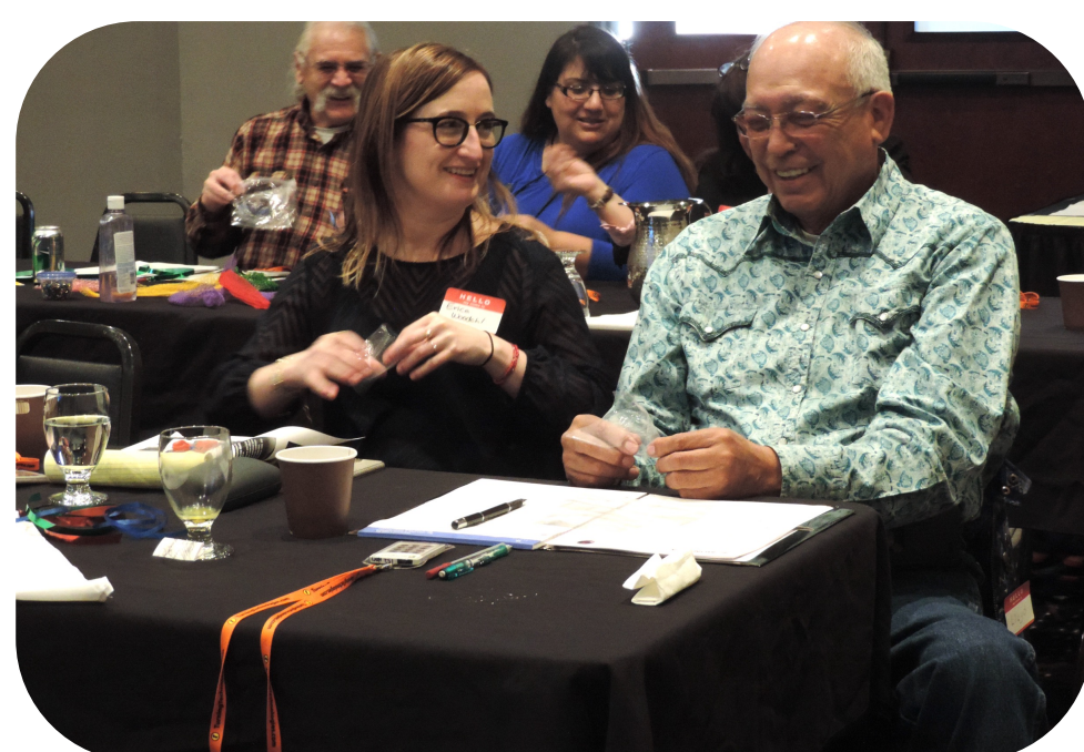
Early Community Consultation

RESULTS: We provided a platform to discuss principles and challenges in PMR with AIAN communities; and ways to move from discussion to action .