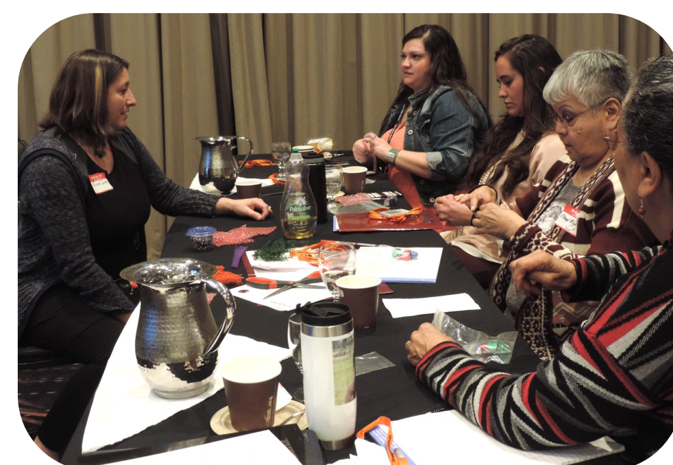
Effective Capacity Development

CONCLUSION: The event represented a culmination of bidirectional learning opportunities and provided a platform for stakeholders to share insights on future PMR within AIAN populations.