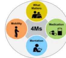
Introducing Age-Friendly Healthcare Framework