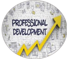
Staff Training in Geriatrics

Clinical Partners- RiverStone Health in Billings and Partnership Health Center in Missoula