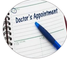
Implementing/Expanding Medicare Annual Wellness Visits