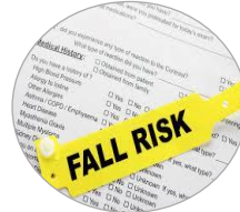
Both CHC's are Implementing a Fall Risk Assessment Program